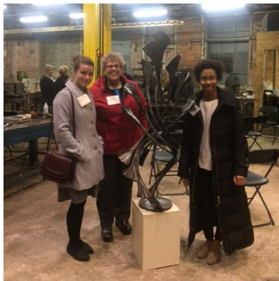
Construction and Building Systems class attending IDA Arc Creations demonstration event.