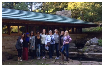
Studio 2 at Kentuck Knob