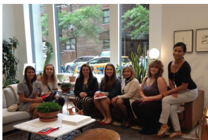
Herman Miller Showroom