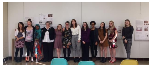
Sophomore students at the conclusion of the Fall Final Critique

Thanks go out to all of our guest critics and reviewers. Your support for the Villa program is greatly appreciated.