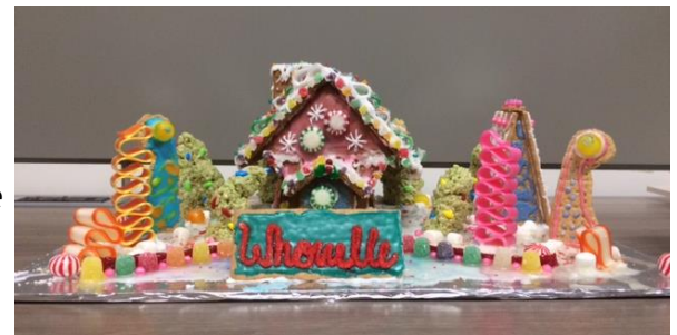
Villa Maria creation for the 3 rd Annual Gingerbread competition held at Millington Lockwood